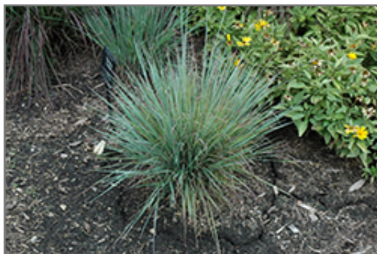
Standing Ovation Bluestem