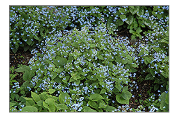
Siberian Bugloss in bloom