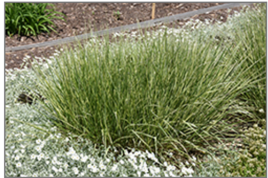
Variegated Reed Grass

Variegated Reed Grass will grow to be about 3 feet tall at maturity extending to 4 feet tall with the flowers, with a spread of 24 inches. It tends to be leggy, with a typical clearance of 1 foot from the ground, and should be underplanted with lower-growing perennials. It grows at a medium rate, and under ideal conditions can be expected to live for approximately 10 years. As an herbaceous perennial, this plant will usually die back to the crown each winter, and will regrow from the base each spring. Be careful not to disturb the crown in late winter when it may not be readily seen!