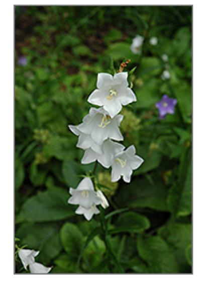
White Peachleaf Bellflower flowers