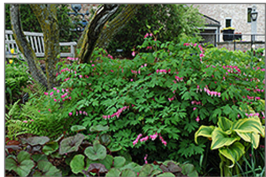
Common Bleeding Heart in bloom