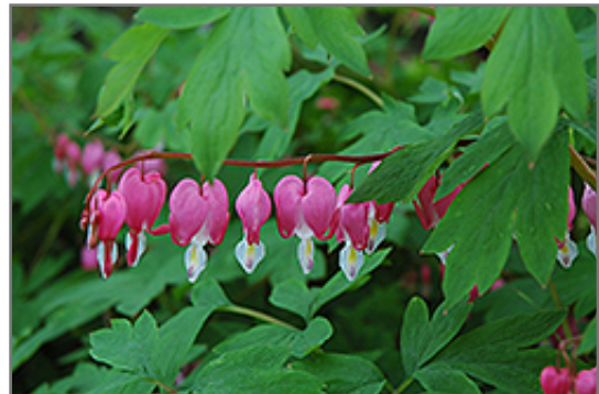
Common Bleeding Heart flowers