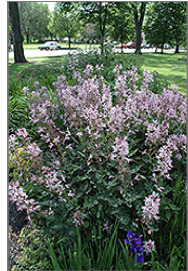
Pink Gas Plant in bloom