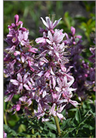
Pink Gas Plant flowers

Pink Gas Plant is recommended for the following landscape applications;