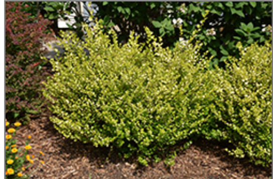
Cesky Gold Dwarf Birch