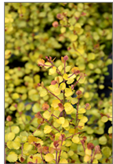
Cesky Gold Dwarf Birch foliage