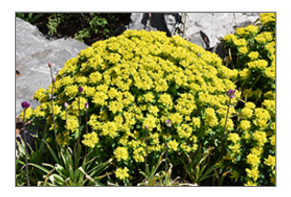
Cushion Spurge in bloom

This is a relatively low maintenance plant, and should only be pruned after flowering to avoid removing any of the current season's flowers. Deer don't particularly care for this plant and will usually leave it alone in favor of tastier treats. Gardeners should be aware of the following characteristic(s) that may warrant special consideration;