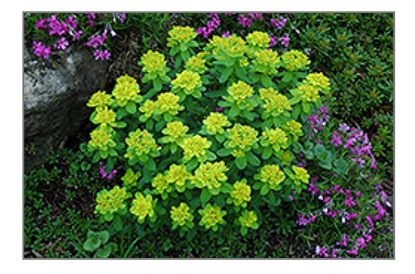
Cushion Spurge in bloom

Cushion Spurge is an herbaceous perennial with a mounded form. Its medium texture blends into the garden, but can always be balanced by a couple of finer or coarser plants for an effective composition.