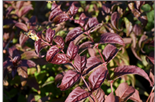
Kodiak Black Diervilla foliage