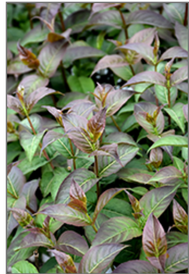
Kodiak Black Diervilla foliage

Kodiak Black Diervilla makes a fine choice for the outdoor landscape, but it is also well-suited for use in outdoor pots and containers. Because of its height, it is often used as a 'thriller' in the 'spiller-thriller-filler' container combination; plant it near the center of the pot, surrounded by smaller plants and those that spill over the edges. It is even sizeable enough that it can be grown alone in a suitable container. Note that when grown in a container, it may not perform exactly as indicated on the tag - this is to be expected. Also note that when growing plants in outdoor containers and baskets, they may require more frequent waterings than they would in the yard or garden. Be aware that in our climate, most plants cannot be expected to survive the winter if left in containers outdoors, and this plant is no exception. Contact our experts for more information on how to protect it over the winter months.