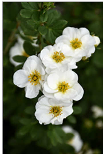
Creme Brulee Potentilla flowers