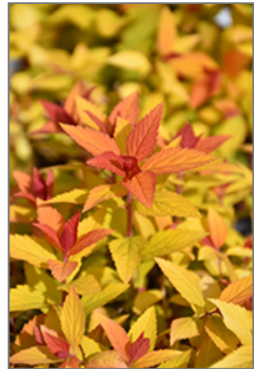
Double Play Candy Corn Spirea foliage

Double Play Candy Corn Spirea is recommended for the following landscape applications;