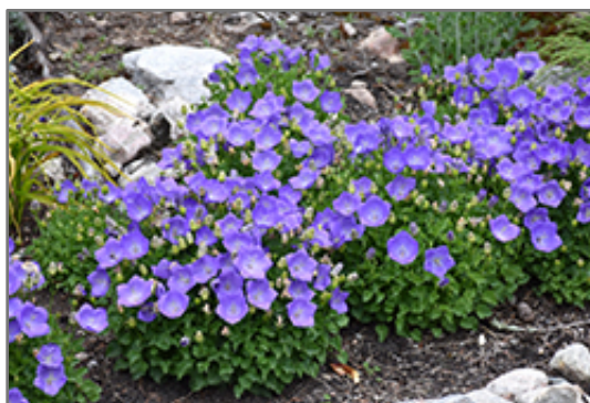
Rapido Blue Bellflower in bloom