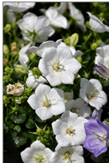
Rapido White Bellflower flowers