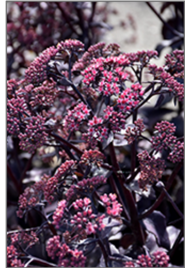
Cherry Truffle Stonecrop flowers

Cherry Truffle Stonecrop is a dense herbaceous perennial with an upright spreading habit of growth. Its medium texture blends into the garden, but can always be balanced by a couple of finer or coarser plants for an effective composition.