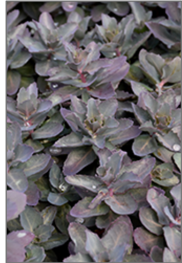
Cherry Truffle Stonecrop foliage

Cherry Truffle Stonecrop is a fine choice for the garden, but it is also a good selection for planting in outdoor pots and containers. It is often used as a 'filler' in the 'spiller-thriller-filler' container combination, providing a mass of flowers and foliage against which the larger thriller plants stand out. Note that when growing plants in outdoor containers and baskets, they may require more frequent waterings than they would in the yard or garden. Be aware that in our climate, most plants cannot be expected to survive the winter if left in containers outdoors, and this plant is no exception. Contact our experts for more information on how to protect it over the winter months.