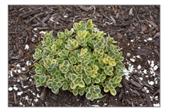
Lime Twister Stonecrop

Lime Twister Stonecrop will grow to be only 4 inches tall at maturity extending to 6 inches tall with the flowers, with a spread of 18 inches. When grown in masses or used as a bedding plant, individual plants should be spaced approximately 15 inches apart. Its foliage tends to remain low and dense right to the ground. It grows at a fast rate, and under ideal conditions can be expected to live for approximately 15 years. As an herbaceous perennial, this plant will usually die back to the crown each winter, and will regrow from the base each spring. Be careful not to disturb the crown in late winter when it may not be readily seen!