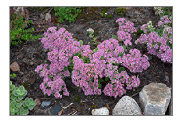
Lime Twister Stonecrop in bloom