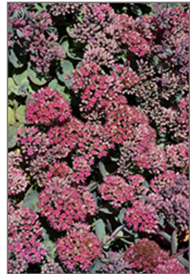
Popstar Stonecrop flowers

Popstar Stonecrop will grow to be about 8 inches tall at maturity, with a spread of 20 inches. When grown in masses or used as a bedding plant, individual plants should be spaced approximately 18 inches apart. Its foliage tends to remain low and dense right to the ground. It grows at a fast rate, and under ideal conditions can be expected to live for approximately 15 years. As an herbaceous perennial, this plant will usually die back to the crown each winter, and will regrow from the base each spring. Be careful not to disturb the crown in late winter when it may not be readily seen!