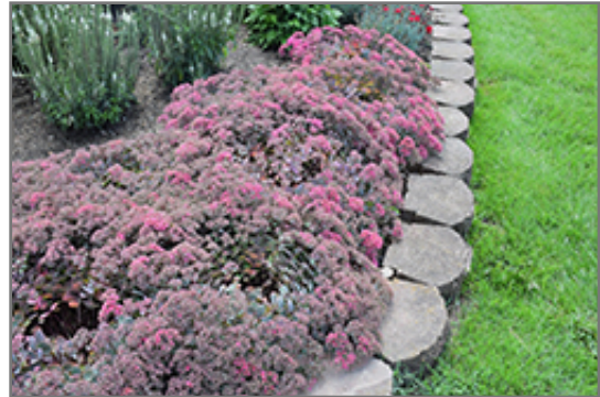
Popstar Stonecrop in bloom