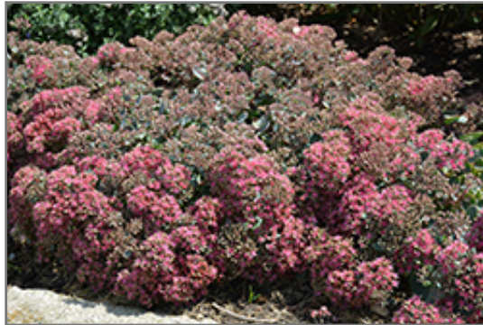
Popstar Stonecrop in bloom