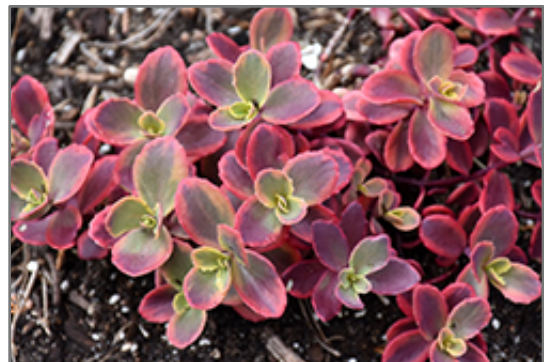
Sunsparkler Wildfire Stonecrop foliage