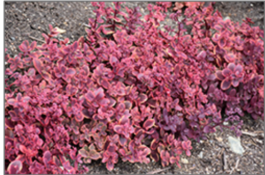
Sunsparkler Wildfire Stonecrop