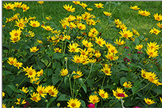
Hohlspiegel False Sunflower flowers