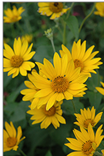
Hohlspiegel False Sunflower flowers

Hohlspiegel False Sunflower is recommended for the following landscape applications;