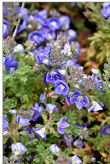
Whitley's Speedwell flowers

Whitley's Speedwell is recommended for the following landscape applications;