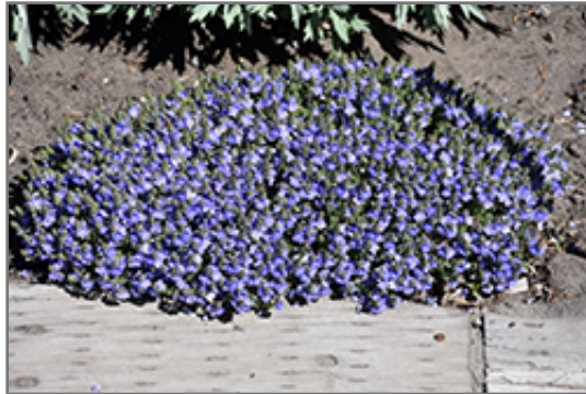
Whitley's Speedwell in bloom