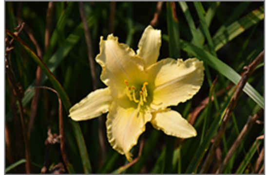
EveryDaylily Cream Daylily flowers

This reblooming, dwarf daylily has light creamy-yellow trumpets with a yellow-green throat; pretty ruffled blooms; sturdy, strong, easy to care for, great grassy texture and form; great for containers, beds, and borders