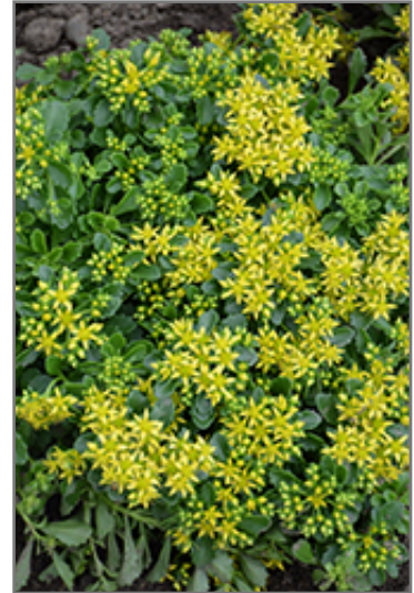
Little Miss Sunshine Stonecrop flowers

Little Miss Sunshine Stonecrop is recommended for the following landscape applications;