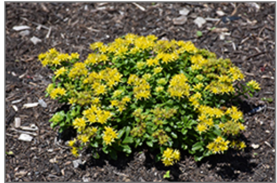
Little Miss Sunshine Stonecrop in bloom