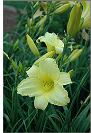
Happy Ever Appster Happy Returns Daylily flowers

Happy Ever Appster Happy Returns Daylily is recommended for the following landscape applications;