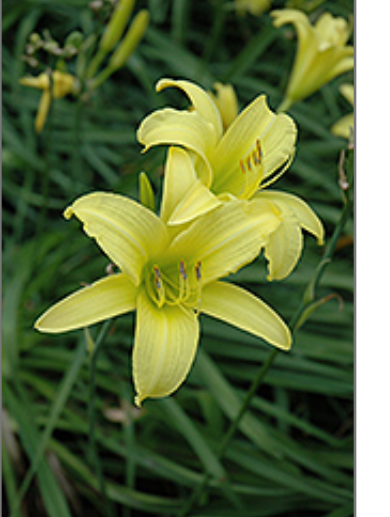
Hyperion Daylily flowers