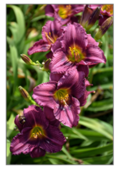
Little Grapette Daylily flowers