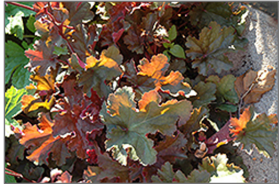
Chocolate Ruffles Coral Bells foliage

Chocolate Ruffles Coral Bells is a fine choice for the garden, but it is also a good selection for planting in outdoor pots and containers. With its upright habit of growth, it is best suited for use as a 'thriller' in the 'spiller-thriller-filler' container combination; plant it near the center of the pot, surrounded by smaller plants and those that spill over the edges. Note that when growing plants in outdoor containers and baskets, they may require more frequent waterings than they would in the yard or garden. Be aware that in our climate, most plants cannot be expected to survive the winter if left in containers outdoors, and this plant is no exception. Contact our experts for more information on how to protect it over the winter months.