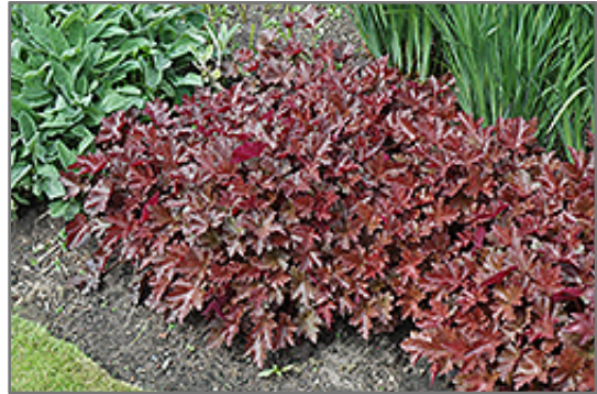
Chocolate Ruffles Coral Bells

This is a relatively low maintenance plant, and should be cut back in late fall in preparation for winter. It is a good choice for attracting hummingbirds to your yard. It has no significant negative characteristics.