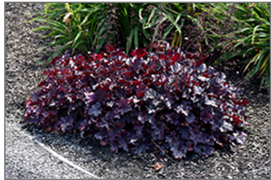
Plum Pudding Coral Bells

Plum Pudding Coral Bells will grow to be only 6 inches tall at maturity extending to 12 inches tall with the flowers, with a spread of 12 inches. When grown in masses or used as a bedding plant, individual plants should be spaced approximately 10 inches apart. Its foliage tends to remain low and dense right to the ground. It grows at a medium rate, and under ideal conditions can be expected to live for approximately 10 years. As an evergreen perennial, this plant will typically keep its form and foliage year-round.