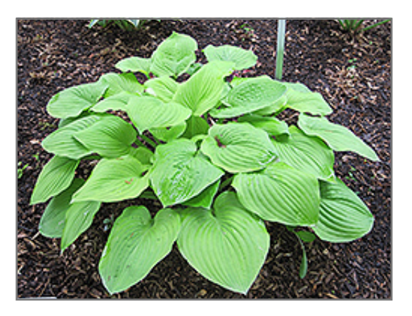
August Moon Hosta