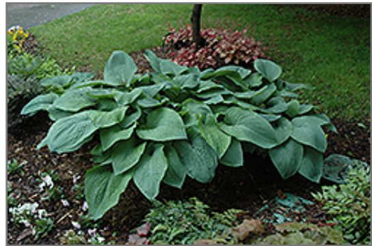
Blue Mammoth Hosta

Blue Mammoth Hosta is recommended for the following landscape applications;