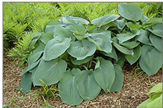
Blue Mammoth Hosta