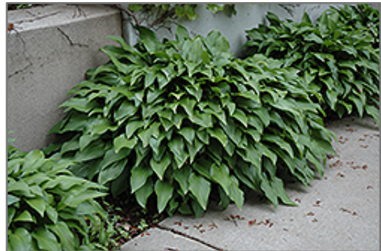
Invincible Hosta

Invincible Hosta is recommended for the following landscape applications;