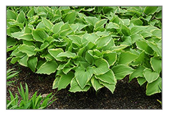
Summer Fragrance Hosta