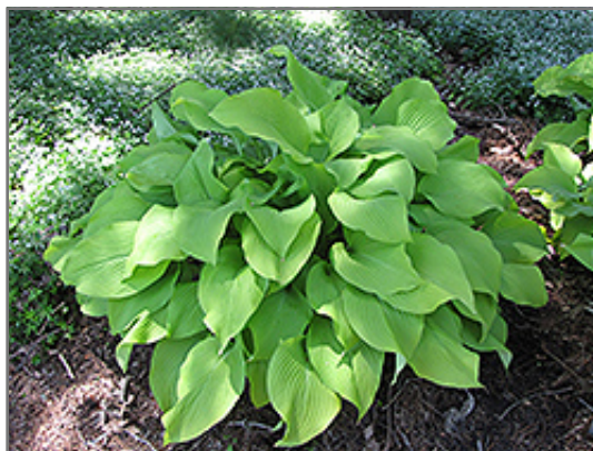
Sun Power Hosta