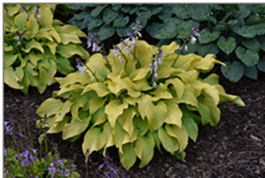
Sun Power Hosta in bloom

Sun Power Hosta is recommended for the following landscape applications;