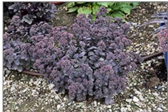
Rock 'N Grow Superstar Stonecrop in bloom