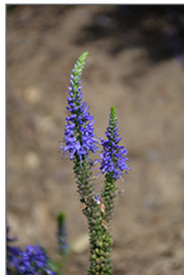
Magic Show Wizard of Ahhs Speedwell flowers