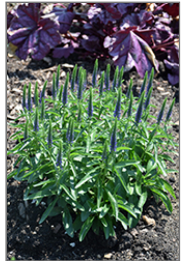
Magic Show Wizard of Ahhs Speedwell in bloom

Magic Show Wizard of Ahhs Speedwell is a fine choice for the garden, but it is also a good selection for planting in outdoor pots and containers. It is often used as a 'filler' in the 'spiller-thriller-filler' container combination, providing a mass of flowers against which the larger thriller plants stand out. Note that when growing plants in outdoor containers and baskets, they may require more frequent waterings than they would in the yard or garden. Be aware that in our climate, most plants cannot be expected to survive the winter if left in containers outdoors, and this plant is no exception. Contact our experts for more information on how to protect it over the winter months.