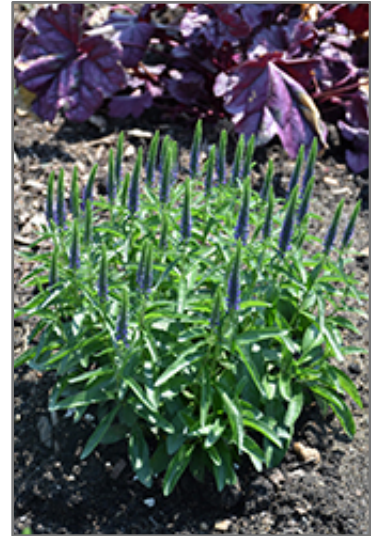
Magic Show Wizard of Ahhs Speedwell in bloom

Magic Show Wizard of Ahhs Speedwell is a fine choice for the garden, but it is also a good selection for planting in outdoor pots and containers. It is often used as a 'filler' in the 'spiller-thriller-filler' container combination, providing a mass of flowers against which the larger thriller plants stand out. Note that when growing plants in outdoor containers and baskets, they may require more frequent waterings than they would in the yard or garden. Be aware that in our climate, most plants cannot be expected to survive the winter if left in containers outdoors, and this plant is no exception. Contact our experts for more information on how to protect it over the winter months.