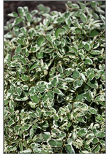
Little Angel Burnet flowers

Little Angel Burnet will grow to be only 4 inches tall at maturity extending to 10 inches tall with the flowers, with a spread of 14 inches. When grown in masses or used as a bedding plant, individual plants should be spaced approximately 12 inches apart. It grows at a medium rate, and under ideal conditions can be expected to live for approximately 15 years. As an herbaceous perennial, this plant will usually die back to the crown each winter, and will regrow from the base each spring. Be careful not to disturb the crown in late winter when it may not be readily seen!