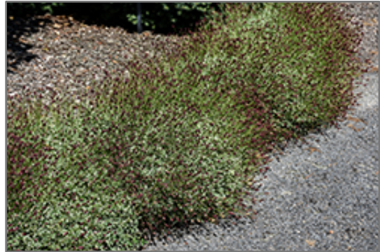
Little Angel Burnet in bloom