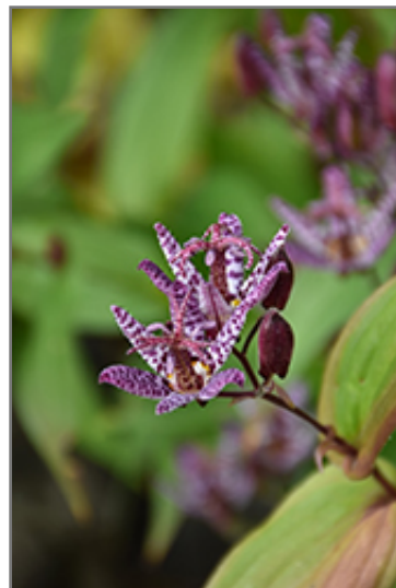
Toad Lily flowers