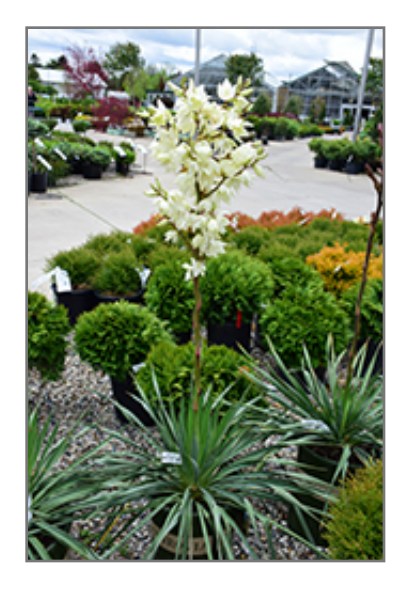
Ivory Tower Adam's Needle in bloom