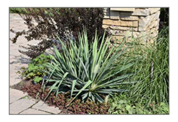
Ivory Tower Adam's Needle