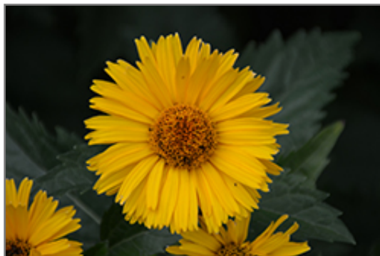
Prima Ballerina False Sunflower flowers

Prima Ballerina False Sunflower is recommended for the following landscape applications;