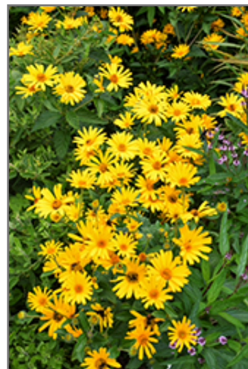
Prima Ballerina False Sunflower flowers