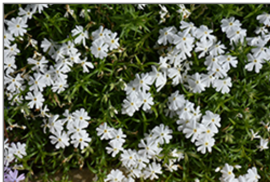
Spring White Moss Phlox flowers

Spring White Moss Phlox is recommended for the following landscape applications;