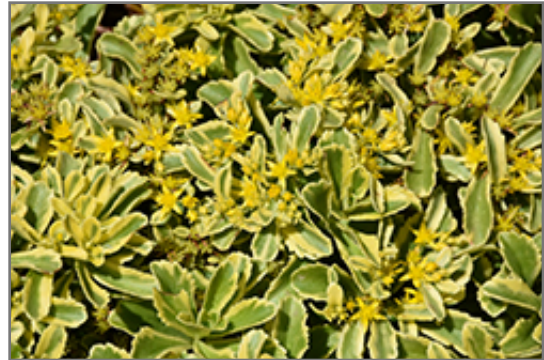
Cutting Edge Stonecrop flowers