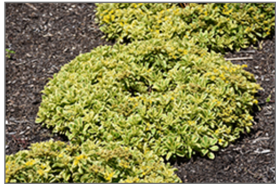
Cutting Edge Stonecrop

Cutting Edge Stonecrop will grow to be only 6 inches tall at maturity, with a spread of 16 inches. When grown in masses or used as a bedding plant, individual plants should be spaced approximately 12 inches apart. Its foliage tends to remain low and dense right to the ground. It grows at a fast rate, and under ideal conditions can be expected to live for approximately 15 years. As an herbaceous perennial, this plant will usually die back to the crown each winter, and will regrow from the base each spring. Be careful not to disturb the crown in late winter when it may not be readily seen!