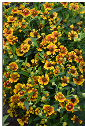
Salud Embers Sneezeweed flowers