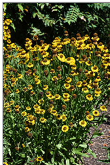
Salud Golden Sneezeweed in bloom