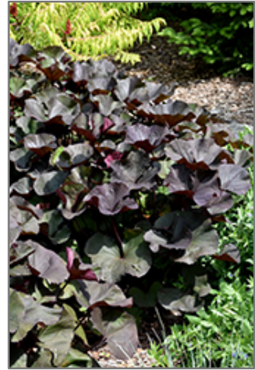
Britt Marie Crawford Rayflower foliage

This plant does best in partial shade to shade. It prefers to grow in moist to wet soil, and will even tolerate some standing water. It is not particular as to soil pH, but grows best in rich soils. It is somewhat tolerant of urban pollution. This is a selected variety of a species not originally from North America. It can be propagated by division; however, as a cultivated variety, be aware that it may be subject to certain restrictions or prohibitions on propagation.