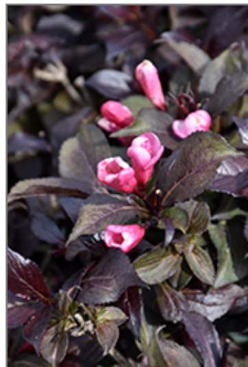
Coco Krunch Weigela flowers