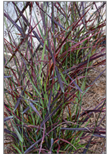
Hot Rod Switch Grass foliage