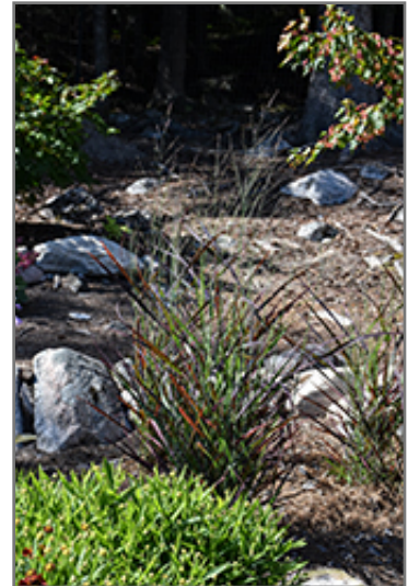
Hot Rod Switch Grass