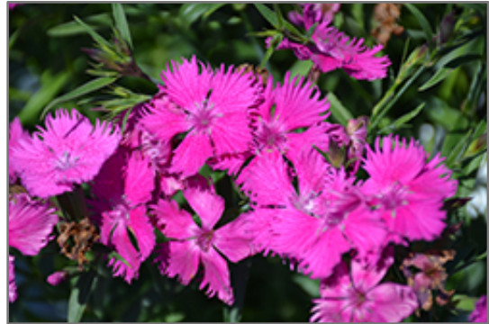
Rockin' Purple Pinks flowers

Rockin' Purple Pinks is an herbaceous evergreen perennial with a mounded form. It brings an extremely fine and delicate texture to the garden composition and should be used to full effect.