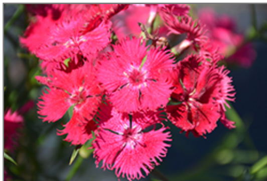
Rockin' Rose Pinks flowers

Rockin' Rose Pinks is recommended for the following landscape applications;