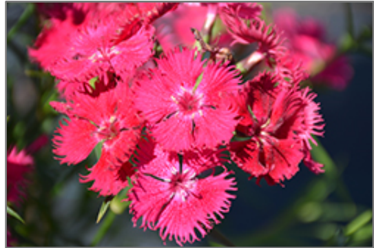
Rockin' Rose Pinks flowers

Rockin' Rose Pinks is recommended for the following landscape applications;