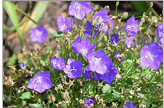
Violet Teacups Bellflower flowers