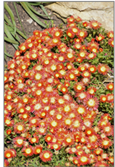
Delmara Red Ice Plant

This is a relatively low maintenance plant, and is best cleaned up in early spring before it resumes active growth for the season. It is a good choice for attracting bees and butterflies to your yard. It has no significant negative characteristics.