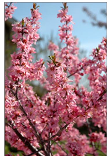
Muckle Plum flowers