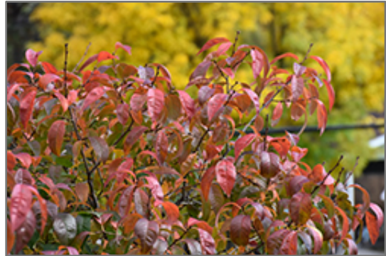
Muckle Plum in fall

This shrub should only be grown in full sunlight. It does best in average to evenly moist conditions, but will not tolerate standing water. It is not particular as to soil type or pH. It is highly tolerant of urban pollution and will even thrive in inner city environments. This particular variety is an interspecific hybrid.