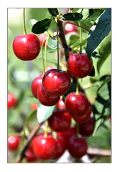
Juliet Cherry (tree form) fruit

Aside from its primary use as an edible, Juliet Cherry (tree form) is sutiable for the following landscape applications;